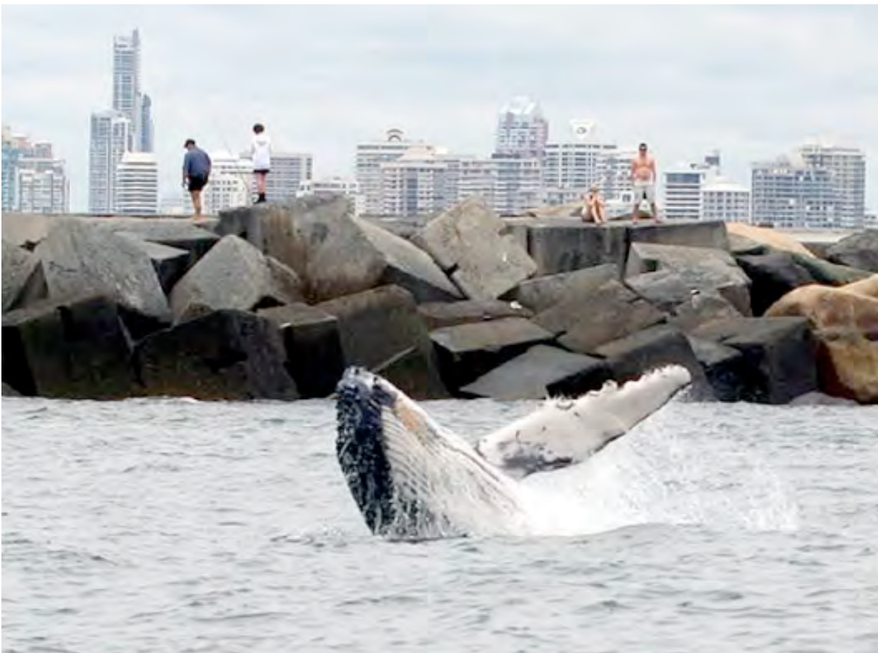
Humpback whales often call the Seaway their temporary home – it is now clear that it has become a vital resting place for mothers and newborn calves during their long migration back to Antarctica | Photo: GCB

http://www.greghunt.com.au/ContactGreg.aspx