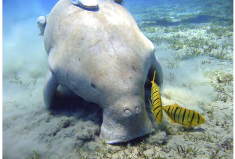
Dugongs are native to the Nerang River and once thrived here. Their numbers are slowly increasing from nearly being wiped out from the area late last century. Seagrass beds as well as other fragile habitats around Wavebreak Island and The Seaway form and critical and important part of their recovery. More and more are being sighted and their recovery should be given all the support we can offer

“The Gold Coast and Southport broadwater have always been home to dugongs, dolphins, turtles and more, and we are just now seeing their numbers increasing. The Seaway and Wavebreak Island now have over a quarter of a century’s worth of recovery and growth behind them; to destroy it all would be irresponsible and negligent. Dugongs and whales are just one small piece of the diversity here though - we have over 450 species of documented marine life here that will all suffer greatly or be lost forever under the irresponsible proposal, along with dozens of migratory and resident birds that rely on the area as a safe and undeveloped roosting location. We’re not talking about a few black swans here, this is the Gold Coast’s very own ‘Barrier Reef Marine Park’ and it is equally diverse and sensitive - it could never endure 15 years of massive construction and an infinite large-scale dredging operation. If this goes ahead and there are mega ships and ongoing dredging, it will very likely permanently convert our turquoise and blue broadwater into a baron and brown dredge-soup.”